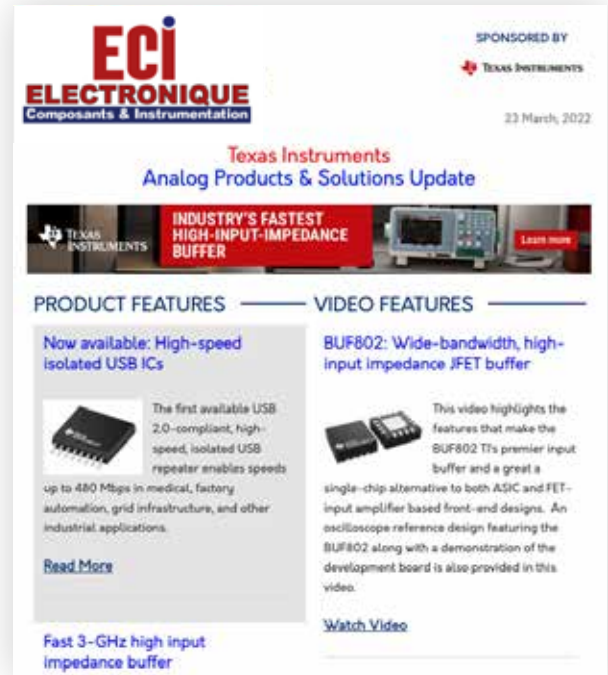
Vertical - 2 Columns