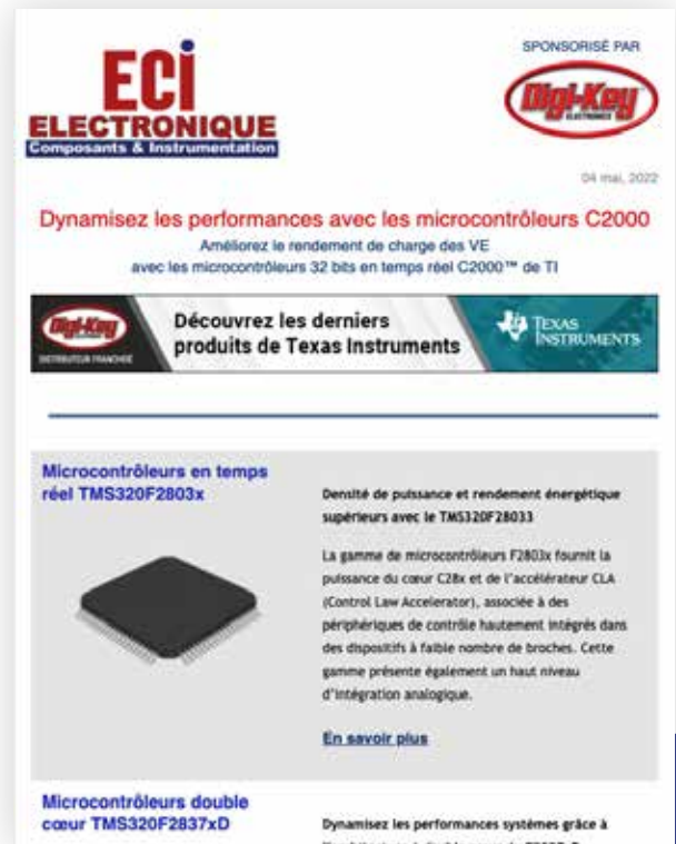
Horizontal - 1 Column